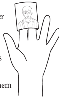
Illustration Display the illustration on page 43 and give each child a copy. Point to the boy’s face and remind the children that we have faces and so does Heavenly Father. Invite the children to point to the face on their copy of the illustration. Repeat for other body parts. Let the children color their illustrations, if desired.

Tracing Trace each child’s hand on a piece of paper. Let them color the tracings. Write on the paper the child’s name and age and the date.