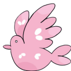
ana bwaintuaraoi te Tamnei ae Raoiroi